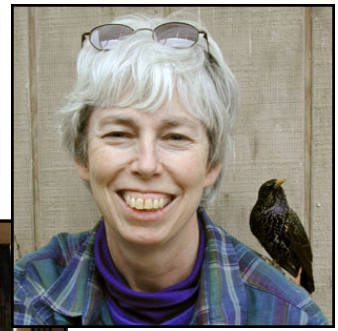
Meredith West Photo Courtesy IU