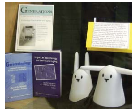
Gerontechnology: Texts and Nabaztag bunnies used for communication.

For more information and the application form see: www.indiana.edu/~gero