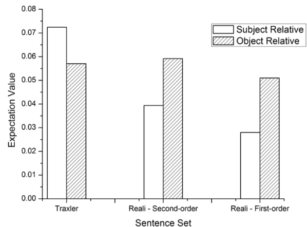
Figure 1. Simulation of the results on relative clause processing from Traxler, et al. (2002) and Reali & Christiansen (2007).

The different expectation values across the three difference sentence types are plotted in Figure 1. This figure demonstrates that for the lists from Traxler, et al. the subject relative clause had higher expectation values, which was highly significant [ F(1,39)=133.74 , p<0.001 ], similar to the behavioral results. However, this pattern reversed itself for both the second-person and first person pronoun sentences, where the object-relative sentences had higher expectation values. Both of these differences were significant, with an F(1,39)=117.61 , p<0.001 for the second-order pronoun sentences and an F(1,39)=9.485 , p=0.004 for the first-order pronoun sentences. This simulation clarifies how this model is generating expectancies: more common structures in language lead to a greater certainty as to what to expect in the upcoming language stream.