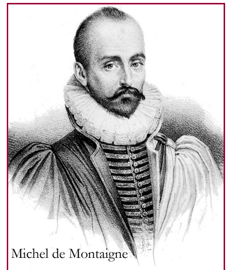
Michel de Montaigne