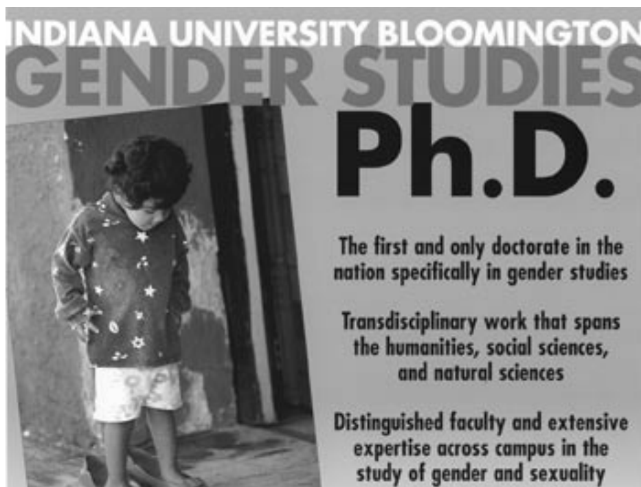
A poster announcing our new doctorate in gender studies