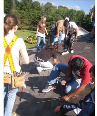
Volunteers braved the heights and the heat to shingle the roof.