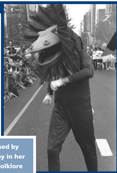
An image used by Sandra Dolby in her Australian Folklore course, showcased at www.teaching.iub.edu

Faculty showcases describe course revisions or the creation of new courses, and detail instructional goals, assignments,