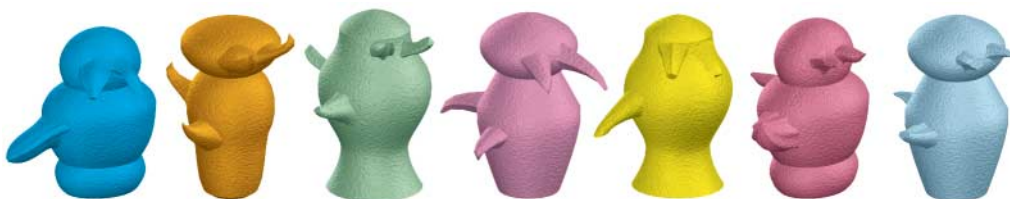
Examples of the visual stimuli used by James and Gauthier.

ORIGINAL RESEARCH PAPER James, T. W. & Gauthier, I. Auditory and action semantic features activate sensory-specific perceptual brain regions. Curr. Biol. 13 , 1792–1796 (2003) | FURTHER READING Kan, I. P. et al. Role of mental imagery in a property verification task: fMRI evidence for perceptual representations of perceptual knowledge. Cogn. Neuropsychol. 20 , 525–540 (2003) | Barsalou, L. W. et al. Grounding conceptual knowledge in modality-specific systems. Trends Cogn. Sci. 7 , 84–91 (2003)