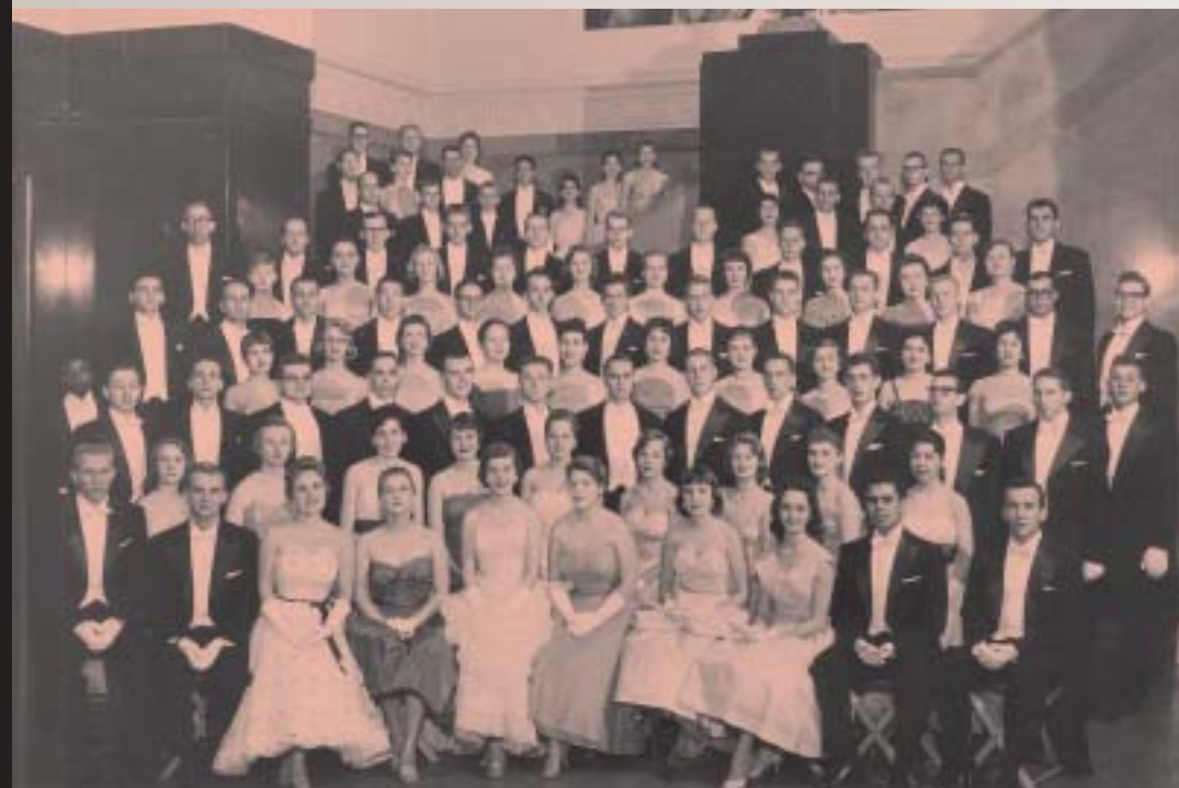
The Singing Hoosiers and Hoosier Queens (1958)