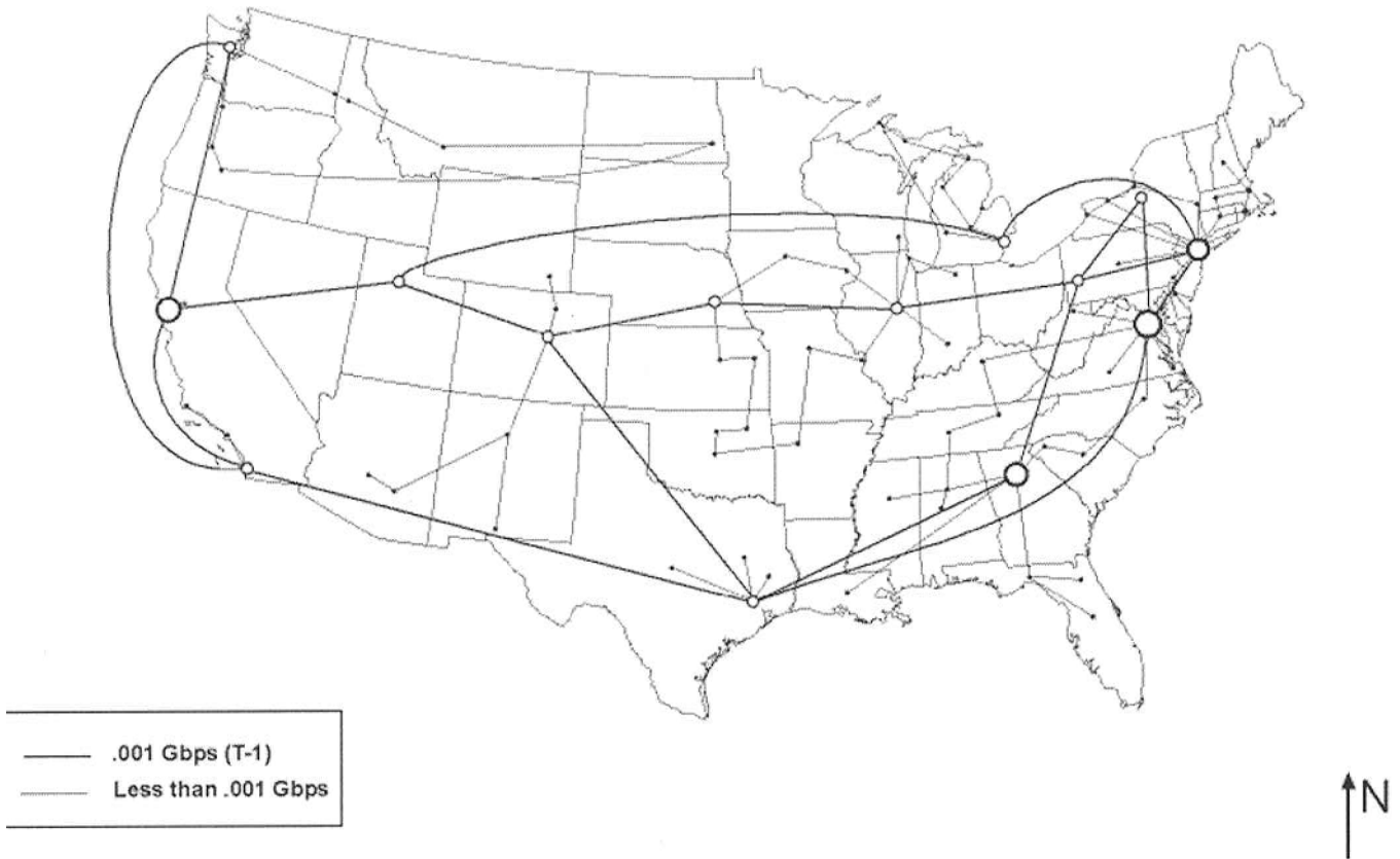
FIG. 2. NSFNet backbone and regional research networks, 1989. Compiled from individual maps in Quarterman (1989) and Salus (1995). Gbps, gigabits per second.

Although any one city connected to any of the backbone networks is theoretically as accessible as any city on any other network (because data travels at the speed of light over fiber-optic networks), there is significant congestion at network hubs and junctions. We focus solely upon the direct links vendors provide between pairs of cities. In this way, we capture both the geographic and market advantages that benefit particular cities. Important pairs of metropolitan areas will be joined directly to minimize delay of transmission, while less important pairs will have intermediate hubs between them in a location convenient for the aggregation and switching of other traffic. These assumptions are derived from the observed structure of these networks, which indicate the importance of direct links between key metropolitan areas.