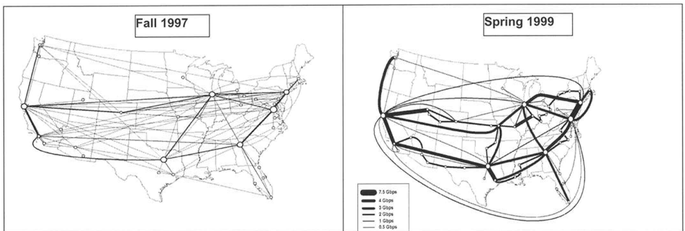
FIG. 3. U.S. Internet backbone, 1997 and 1999. Compiled from individual network maps in Boardwatch Magazine Internet Service Providers Quarterly Directory (1997, 1999).

other metropolitan areas. The emerging secondary hubs, which were identified earlier in the analysis of backbone capacity, do not experience a similar level of competition because much of their growth in capacity is attributable to the construction of large-capacity networks by a handful of companies. However, it is interesting to note that while metropolitan areas such as Philadelphia and Baltimore, which do not boast very large capacities or diversity of